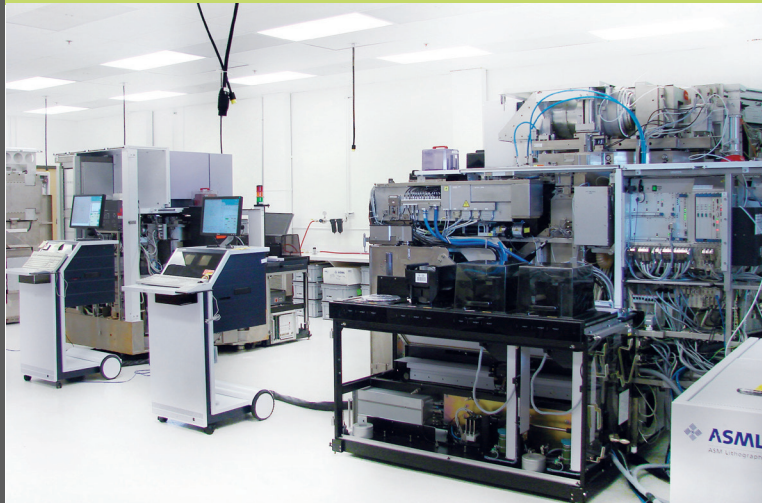
EOTS Cleanroom - Vancouver, WA

Thanks to the 2016 purchase of all Litho-Service's assets, EO Technical can now sell more parts without an exchange. This allows for simplified ordering of stores items that are purchased on a regular basis, or for customers who wish to bolster their inventory. Email Litho@eotechnical.com for more details.