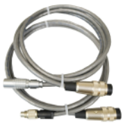
LVDT to TESA Cable