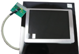
OCU - LCD Upgrade Kit