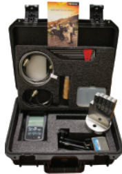
WS Adjustment Kit