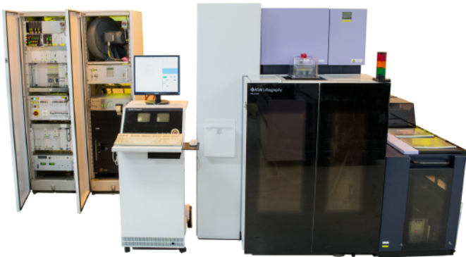
ASML PAS5500 /22 Qualified At EOTS Lab

EOTS is plunging into 2018 with more parts, more service contracts and more equipment activity than ever before. As the largest second-source for ASML systems, our goal is to continually improve on existing rebuild capabilities, while expanding our product portfolio and support capabilities in the PAS2500/5000/5500 Market.