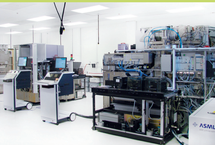
EOTS Cleanroom - Vancouver, WA

Thanks to the 2016 purchase of all Litho-Service's assets, EO Technical can now sell more parts without an exchange. This allows for simplified ordering of stores items that are purchased on a regular basis, or for customers who wish to bolster their inventory. Email Litho@eotechnical.com for more details.